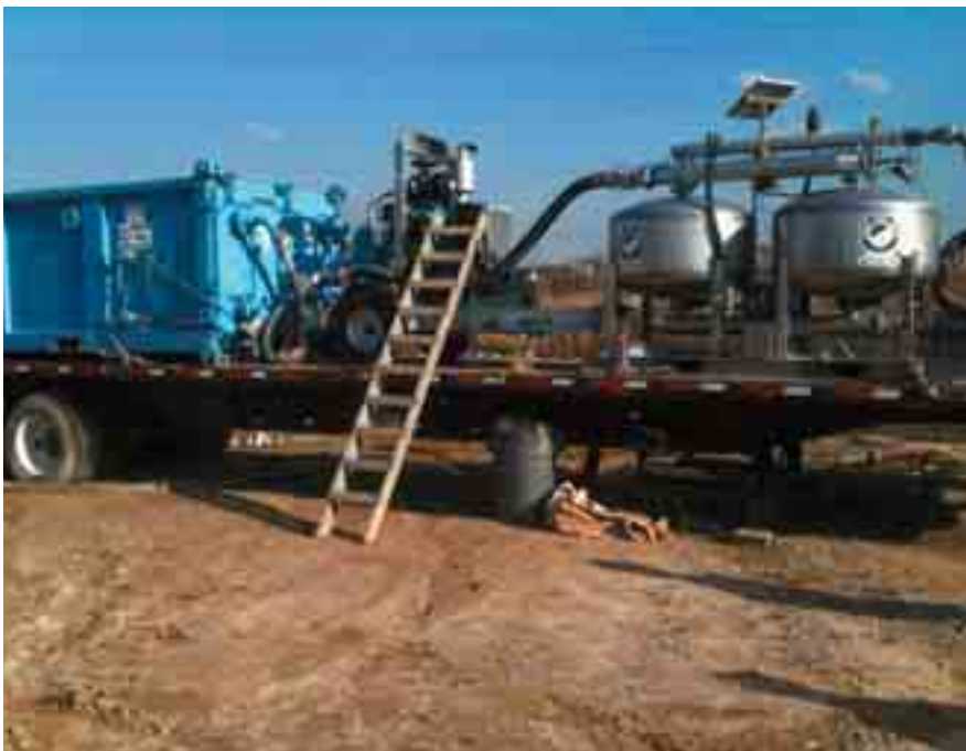
▲ ATS with baffle box, pump and filters