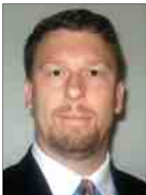
By Frank Kneib, MBA

The Maryland State Highway Administration's Intercounty Connector (ICC) project is an example of a construction site that would fall under the new ruling. Over the past two years, the project has made use of Active Treatment Systems to control stormwater discharges. The stormwater control systems in place on this site already meet the new EPA guidelines. Not only do the turbidity readings perform better than the requirements stipulate, but the costs of the systems fall well below the EPA's reviewed summary of $0.02/gallon for cost-effective erosion and sediment control and compliance.