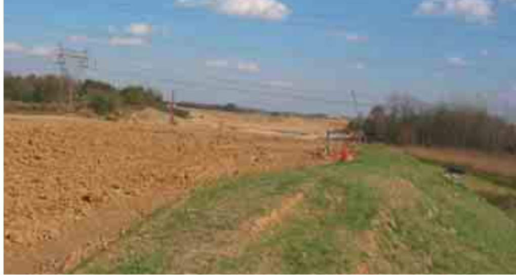
▲ View of construction on section C

Once the new EPA Effluent requirements are fully implemented, they will reduce significantly the amount of sediment and other pollutants discharged