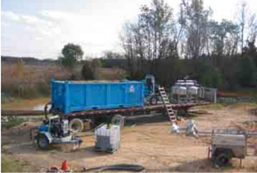
▲ Rain for Rent Active Treatment System (ATS)