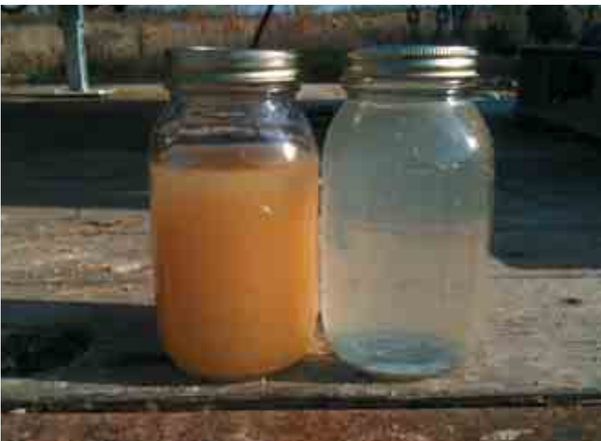
▼ Water samples before and after treatment

ICC stormwater runoff was stored in ponds where turbid water is typically kept prior to treatment. Power Prime™ pumps moved the water from the ponds to the tube settler where the chitosan was injected. This process ensured that the water quality parameters were met and allowed for higher flow rates. Higher flow rates ensured that no off-specification water left the site, even during rain events.