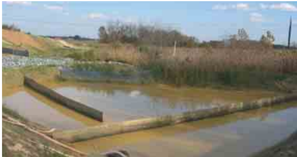
▲ Settling pond prior to ATS

from construction sites. The guidelines state that the running total cost of treatment for a project like the ICC project is $0.02/gallon. Recent data collected on the ICC site in November of 2009 shows an average cost (not including labor or fuel) of only $0.0049/gallon. Each portable treatment trailer is capable of the following: